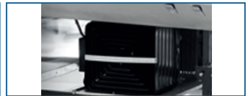
Easy Access to Compressor