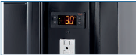
Electronic Digital Controller