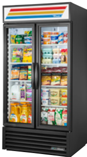
Standard Black Exterior