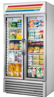
Optional Stainless Exterior